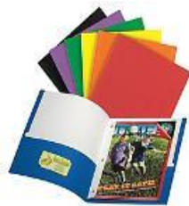
Three-prong portfolio with two pockets